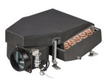
Low Profile air handler 6,000 BTU/h – 18,000 BTU/h

The central chiller unit is typically installed in the engine room, providing chilled water/glycol to all cabins via a water circuit. One or more air handler(s) in each cabin are fitted to generate the required cooling capacities individually in each room.