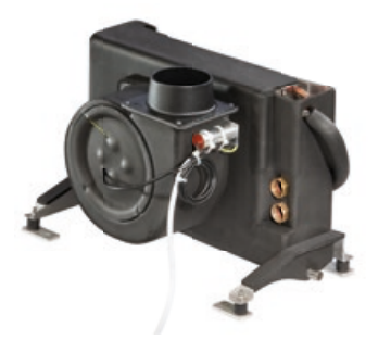
Compact air handler 4,000 BTU/h – 36,000 BTU/h