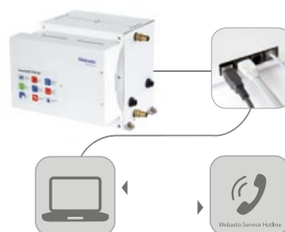
BlueCool Export Tool

BlueCool Export Tool suitable for all BlueCool AC units: