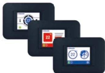
BlueCool MyTouch Display

The BlueCool MyTouch display is the new standard display for all BlueCool A/C Series: