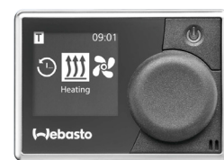
▪ MultiControl (RV Classic) (12V)