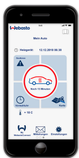
▪ ThermoConnect TCon2